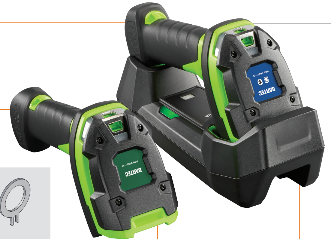
1D and 2D Barcode reader options Ultra rugged construction